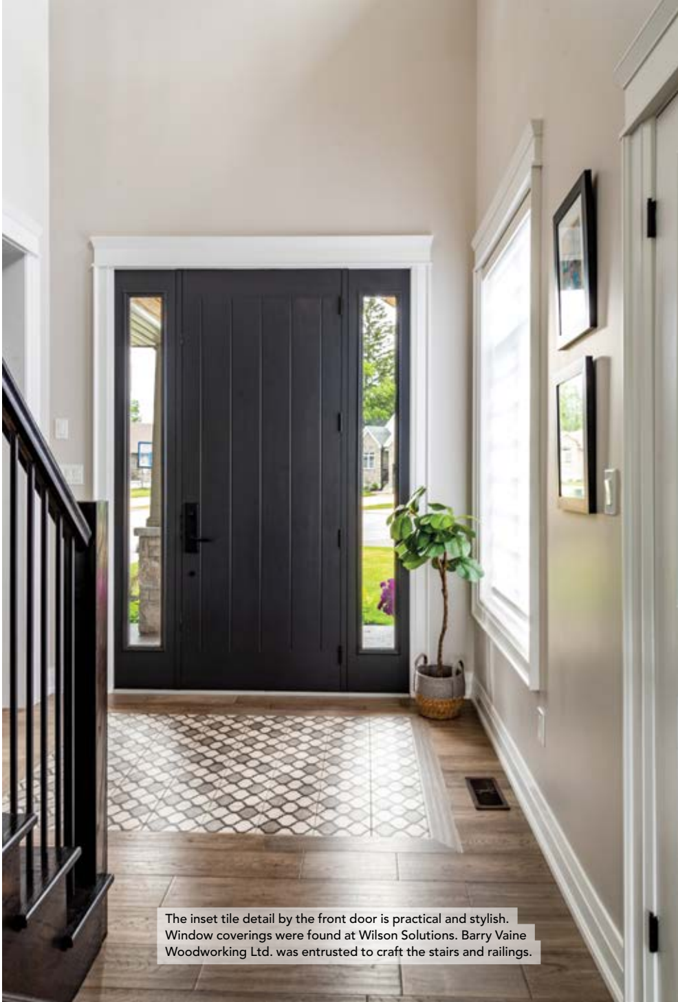
The inset tile detail by the front door is practical and stylish. Window coverings were found at Wilson Solutions. Barry Vaine Woodworking Ltd. was entrusted to craft the stairs and railings.