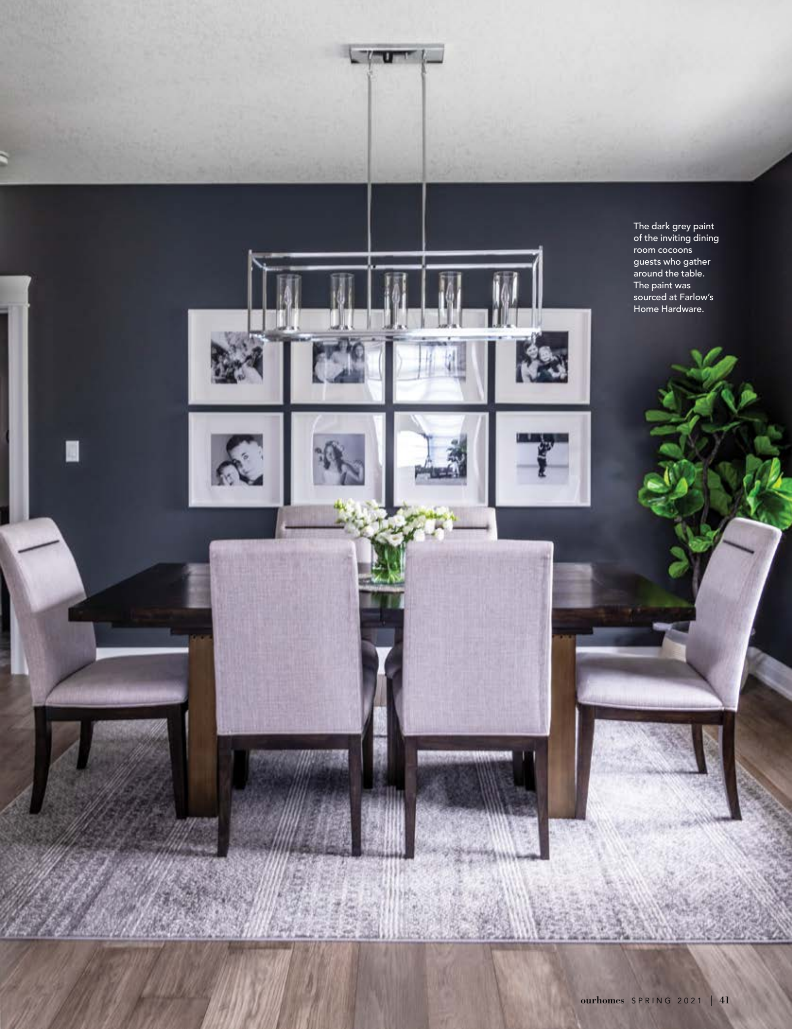
The dark grey paint of the inviting dining room cocoons guests who gather around the table. The paint was sourced at Farlow's Home Hardware.