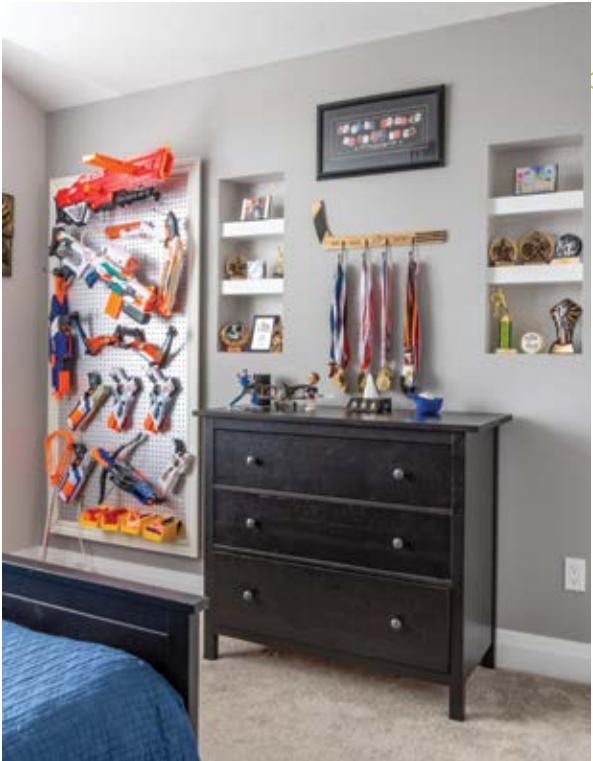
TOP RIGHT: An office area on the upper level overlooks the front foyer. ABOVE: Carpeting in the master bedroom offers sound insulation and comfort. LEFT: A pegboard organizes Cole's Nerf armoury. Shelves display sporting awards.

Candue will have a busy 2021 with a sold-out year. They have opened a new shop and office, and look forward to sharing more of Candue with the Grey-Bruce community. In the meantime, the Weltz family will be soaking up all that their home, and their area, have to offer. OH