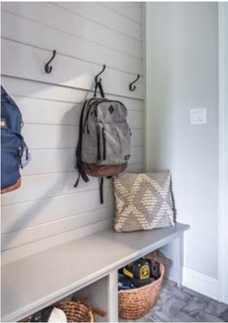
LEFT: Dining on the covered rear deck can be enjoyed even if it is raining. Glass railings highlight the view to the forested area at the rear of the property. ABOVE: The mudroom has a shiplap accent wall with lots of hooks for outdoor gear, bench seating and baskets to keep smaller items contained. BELOW: A large comfortable sectional sits opposite the dining area on the rear deck. The matching firepit table adds ambience in the evening.