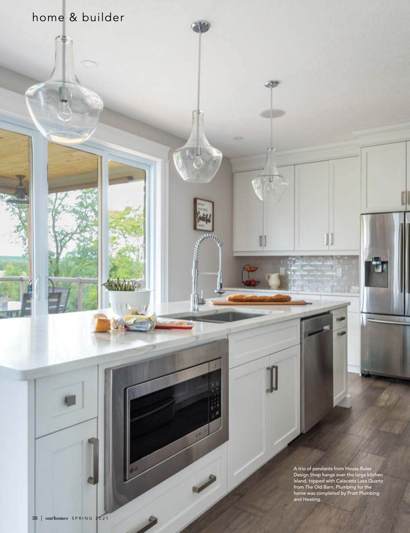
A trio of pendants from House Rules Design Shop hangs over the large kitchen island, topped with Calacatta Laza Quartz from The Old Barn. Plumbing for the home was completed by Pratt Plumbing and Heating.