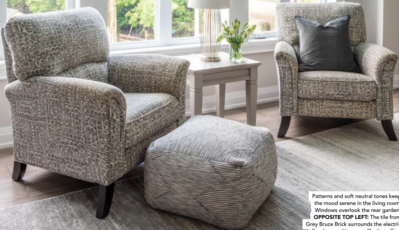
Patterns and soft neutral tones keep the mood serene in the living room. Windows overlook the rear garden. OPPOSITE TOP LEFT: The tile from Grey Bruce Brick surrounds the electric fireplace and has a profile that offers depth and visual interest. Open shelves are accented with décor items sourced at Temptations Gifts & Home Decor and Flowers by Uss.

CANDUE IS LIKE ONE BIG FAMILY. WORK BECOMES FUN WHEN YOU LOVE THE PEOPLE YOU WORK WITH.