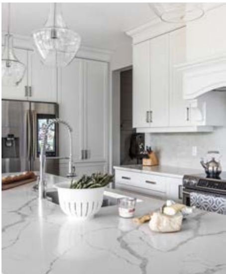
ABOVE: Dinner prep for fresh spring asparagus alfredo is easy with the vast counter space the island provides. RIGHT: A stream of beloved family photos plays on the Samsung french-door refrigerator. Engineered hardwood from The Source Flooring adds a warm undertone to the white shaker-style custom cabinets by Barzotti Woodworking Ltd. BELOW: Sliding doors lead to the large rear deck. Seating at the island is convenient for homework or snacking.