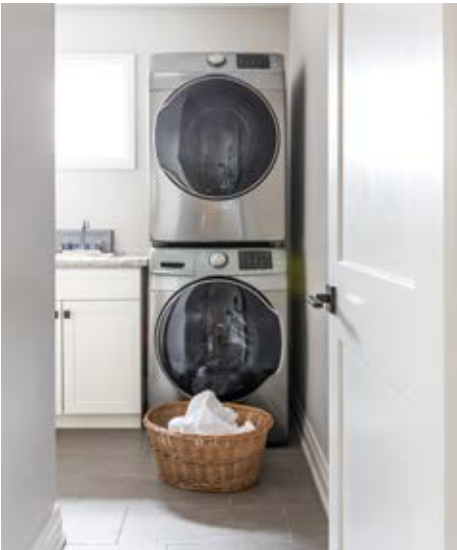
LEFT: A basket-weave tile inset resembling an area rug in the master bathroom is repeated in the shower. Tile was sourced at Cuneo Interiors Carpet One Floor & Home. Dingwall Electric installed the pendant over the vessel tub. ABOVE: A must-have for Becky was a second-floor laundry. With a busy family, the location makes laundry a breeze. BELOW: In the master bath, the large glass enclosed shower has multiple shower heads and tile that lines the walls and ceiling.